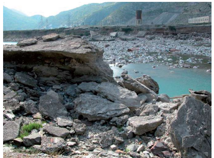
Above, top: Figure 4 – Damaged concrete slab of concrete face rockfill dam detected after the first filling of the reservoir; Figure 5 – Erosion damage at dam toe (left) and concrete protection in plunge pool after operation of the tunnel spillways (right)