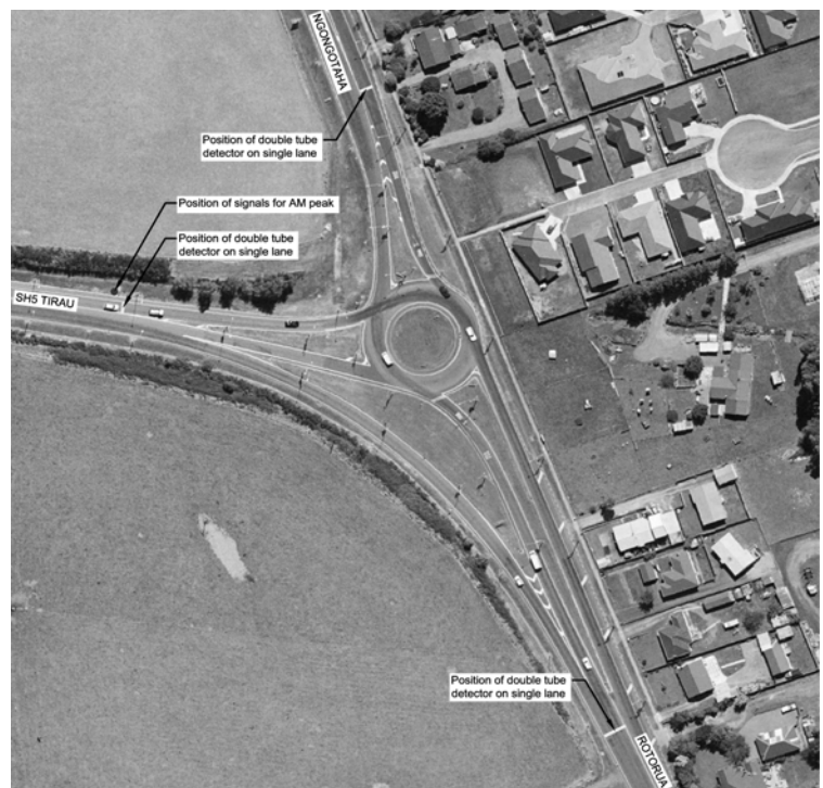
Figure 2 - Roundabout layout

The northbound SH 5 leg includes a continuous left turn slip lane that splits off approximately 80m before the roundabout and bypasses the roundabout.