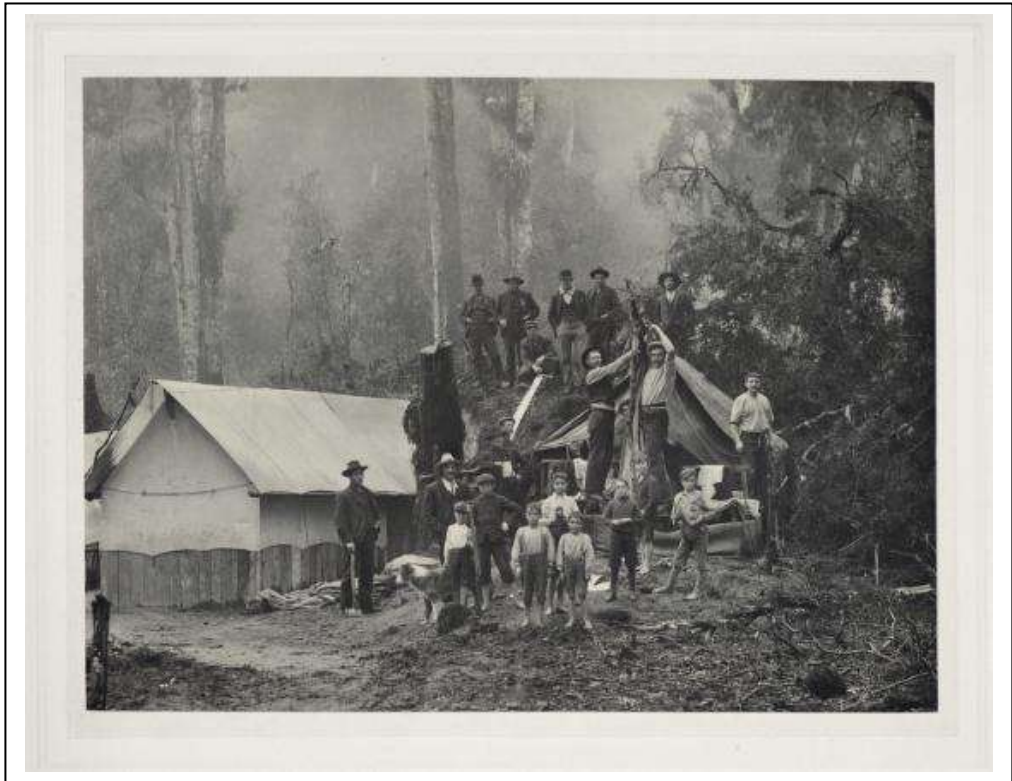
Figure 2: English railway workers erecting camp at Raurimu, ca 1906.

The NIMT's development benefitted and opened part of the North Island in particular, but had wide ranging effects on the economy and society in general. Improvements were noted within travel, communications and infrastructure across areas of country which had previously been closed to European settlement, as the railway's progression saw auxiliary roads and telegraph wires developed aside the rail tracks. 24