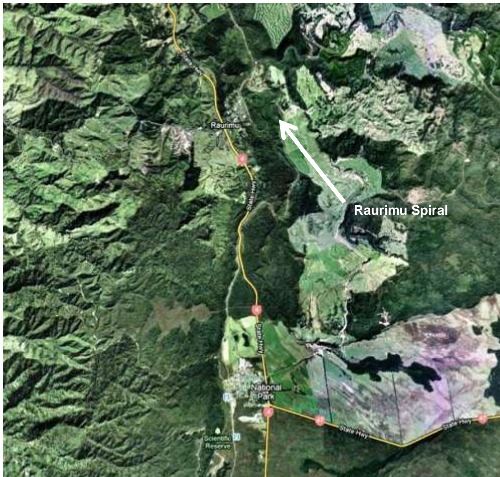
Location map courtesy of GoogleMaps

Access information: The spiral can be partially viewed from the Raurimu Spiral Scenic Reserve next to State Highway 4 at Raurimu. NIMT trains also pass through the Raurimu Spiral.