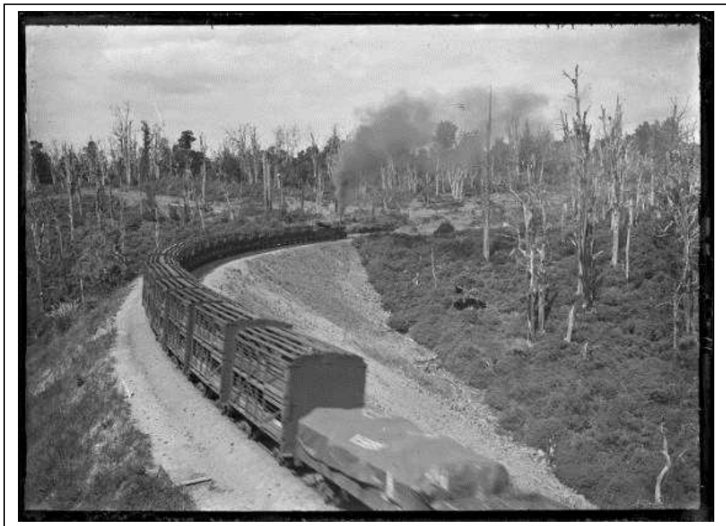
Figure 1: A steam locomotive pulling a goods train ascending the Raurimu Spiral, on the North Island Main Trunk Line, 1917.