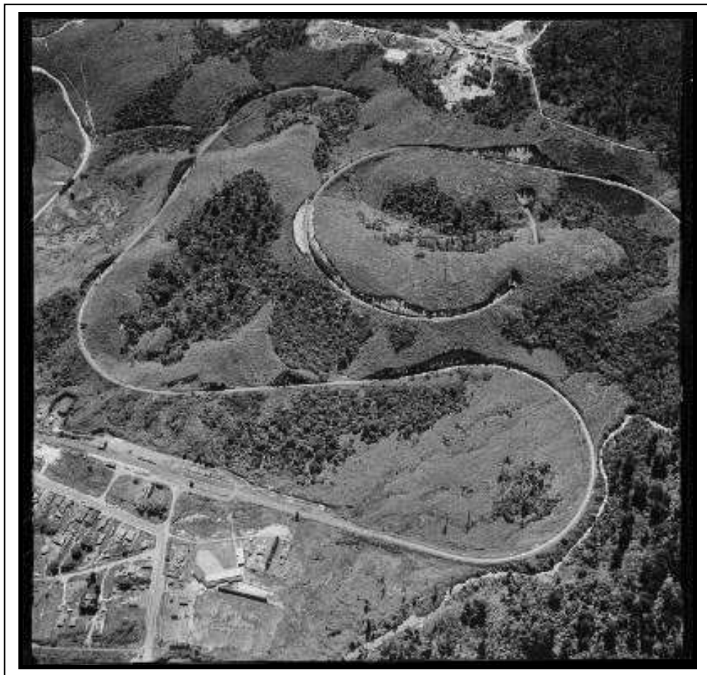
Aerial view of Raurimu Spiral on the Main Trunk railway line between Auckland and Wellington, with Raurimu township at the bottom left.