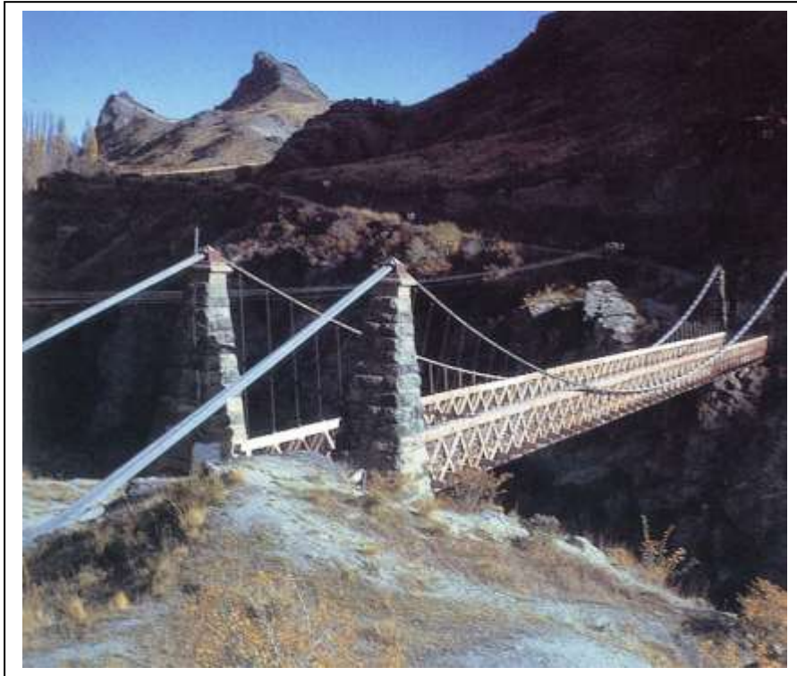
Figure 5: Kawarau Gorge Suspension Bridge prior to bungee jumping venture. Thornton, colour plate, p.11

for the suspension cables to be anchored in vertical shafts. 43 This was the only diversion from the original plans, which Higginson prepared in 16 days, making the speed with which the bridge was formulated even more remarkable. 44 Unusually, and in a move dictated by the high winds frequent in the gorge, the anchorages and towers are not aligned with each other because Higginson employed an American practice of using cables with a slight horizontal curve in order to give the structure greater lateral stability. 45