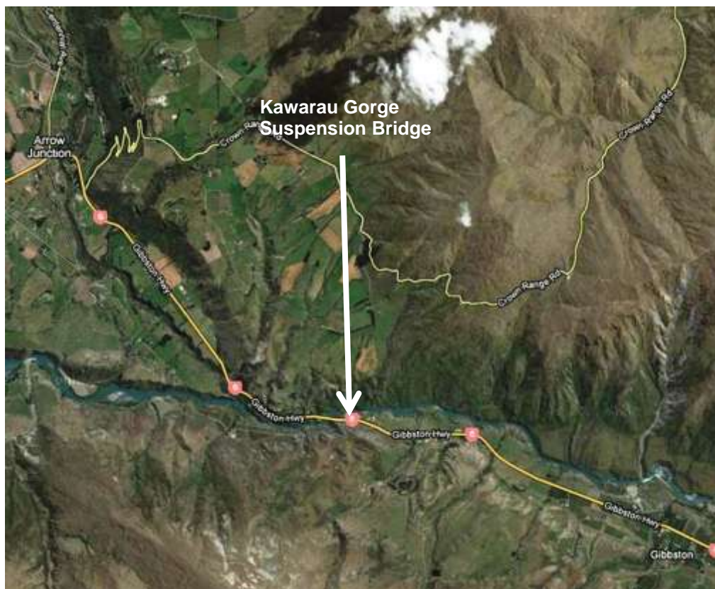
Location map courtesy of GoogleMaps

Access information: The bridge is set within a Department of Conservation reserve and is used by the commercial bungy jumping venture known as AJ Hackett Bungy. This is signposted on State Highway 6/Gibbston Highway northwest of Gibbston township, and immediately east of the current highway bridge across the Kawarau Gorge. The structure is visible from the highway when approaching from the west.