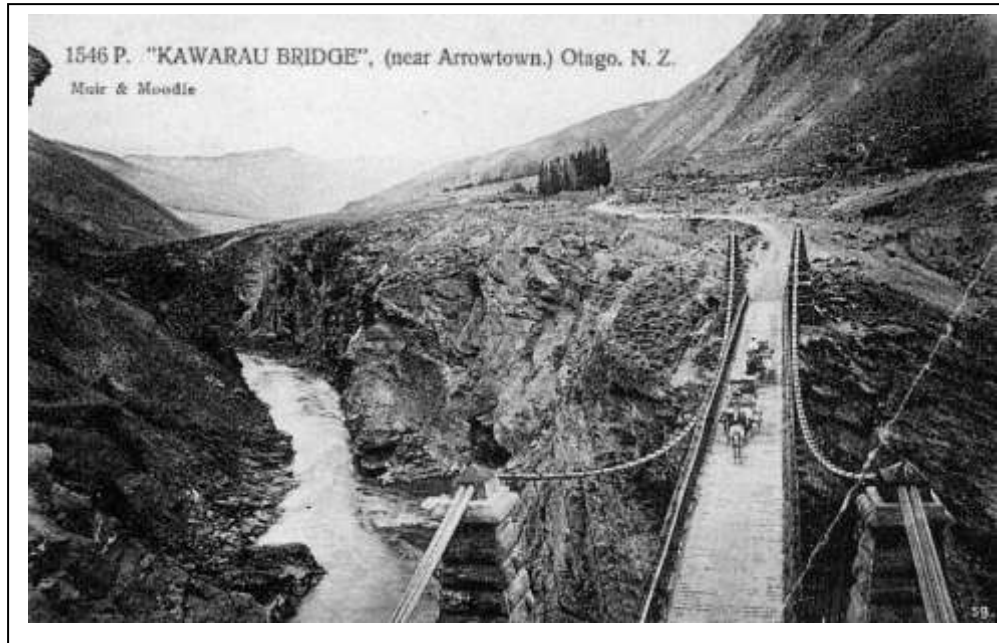
Figure 3: Kawarau Bridge, (near Arrowtown) Otago, N.Z. Cook, p.16

After its completion in 1880 the Kawarau Gorge Suspension Bridge quickly became a celebrated structure and landmark. 35 Even though the main highway was diverted away from it in the 1960s, the Kawarau Gorge Suspension Bridge remained a popular tourist site and in the early 1980s it was said that “there is hardly a moment in the day when cars are not drawn up at its approaches.” 36