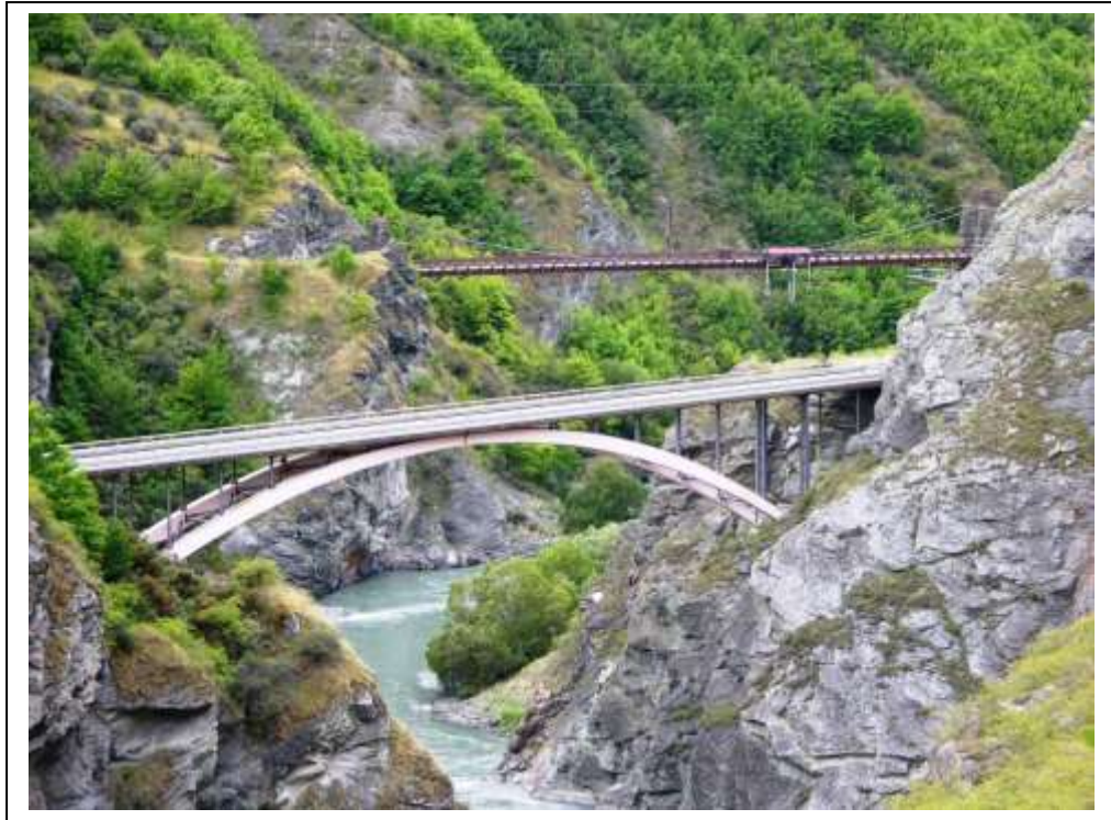
Figure 2: The 1963 highway bridge with Kawarau Gorge Suspension Bridge in the background, January 2006.