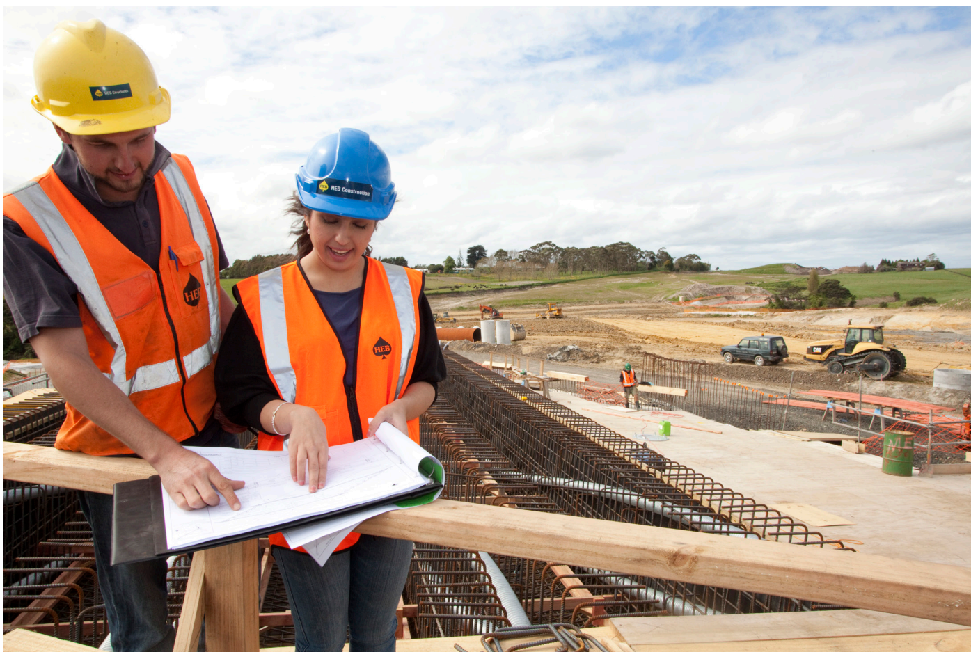
'Construction Site'

graduates with a BE (Mining) degree were practising as civil engineers.