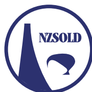
Eildon Dam upgrade November 2004